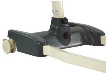
Electric leg adjustment. Easy and effortless solution for positioning lifter when transferring a user.