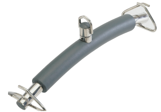
2 point spreader bar as standard.