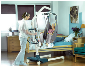
Full lift range and good clearance for the user.