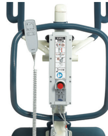
Intelligent monitoring system.